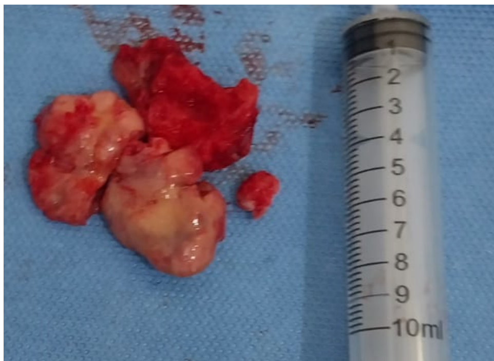
Figure 3: image of osteoma after complete surgical excision